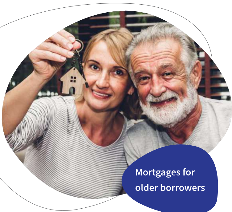
Mortgages for older borrowers

There is no official maximum age when it comes to applying for a mortgage – lenders will set their own maximum age limits and you will need to prove that your income in retirement is more than enough to cover the repayments and other outgoings. It's likely that the length of mortgage (mortgage term) will be restricted, and your choice of products will be limited; although the number of products could grow as demand increases due to changing requirements for living arrangements following the pandemic.